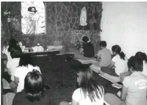
Sharing the charism to young people